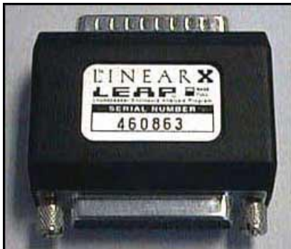
Key Model: MMK