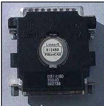
Key Model: 1410